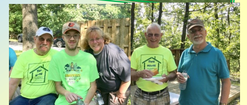
Adult Volunteers & High School Mentors